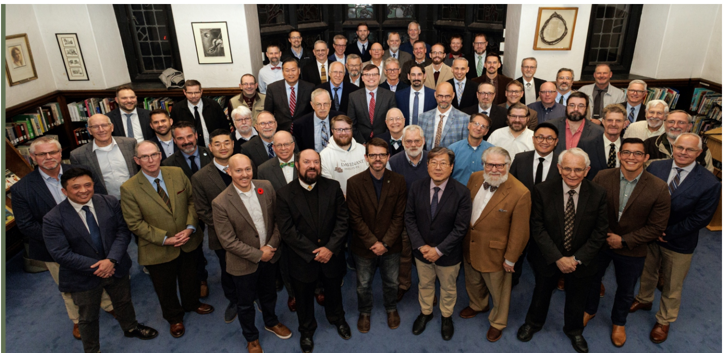
NAPARC 2026 group photo

The minutes of the Council, along with NAPARC’s Constitution, Bylaws, and other resources, can be found at NAPARC’s website: naparc.org . The next meeting of the Council is scheduled for November 10-12, 2026, to be hosted by the URCNA at the First United Reformed Church in Oak Lawn, Illinois.