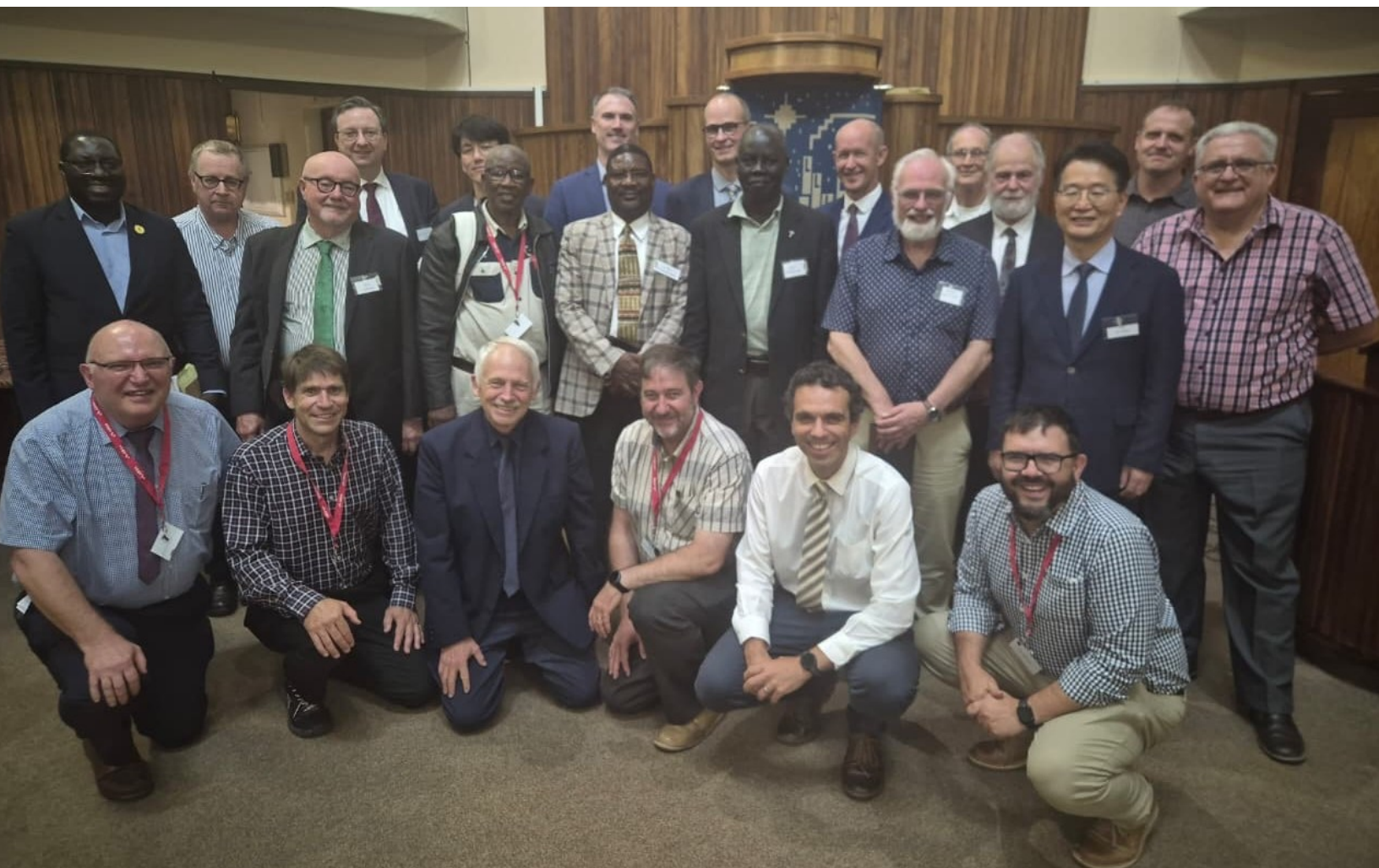
Hosts for and guests at GS 2026

The Synod bears witness that Christ governs and preserves His church, and that He continues His work worldwide to the glory of His Name.