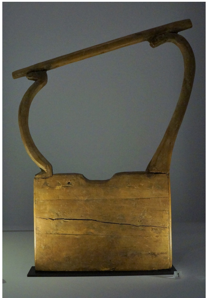
A kinnor – the Jewish lyre” with below that the attribution: “