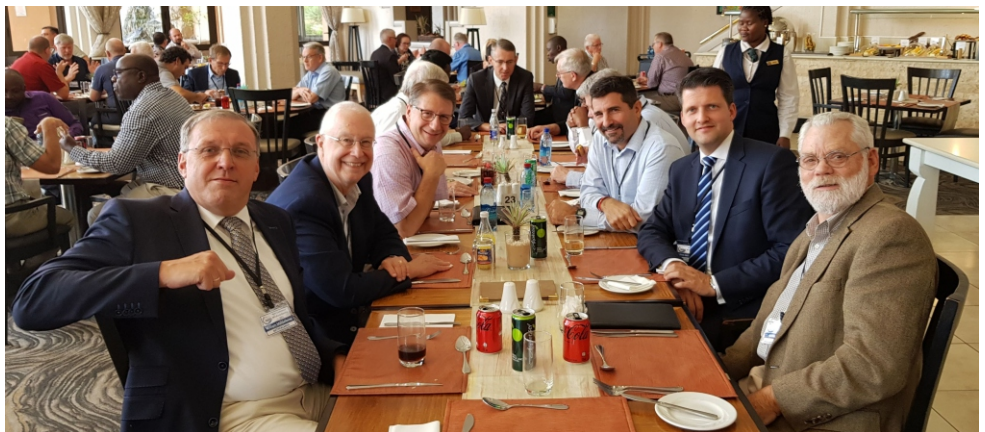
CGK and OPC delegates at ICRC 2022