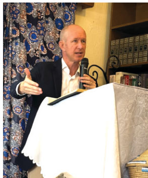
Preaching at All Nations in Mbale, Uganda