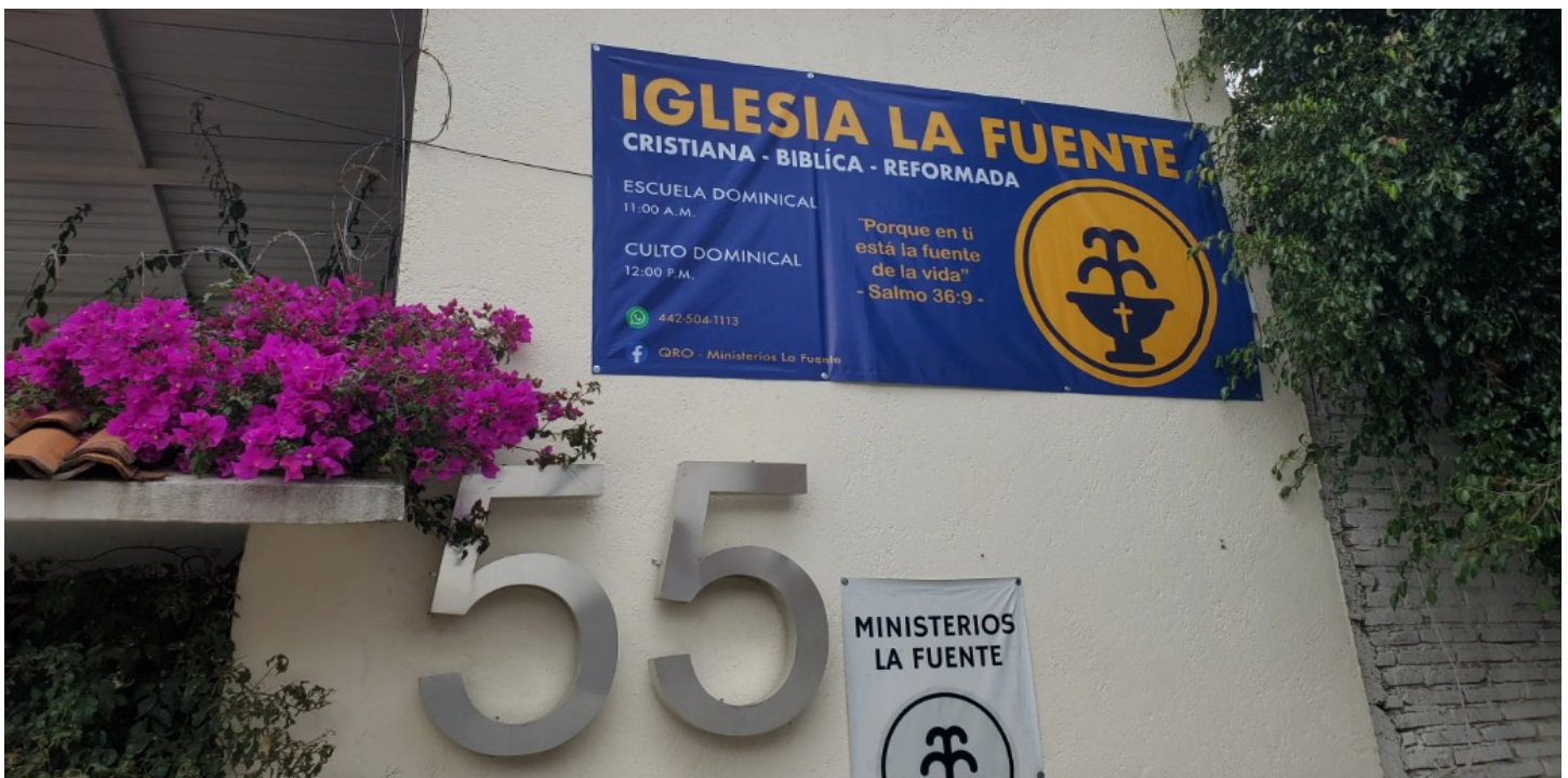
The Fountain Church – Queretaro, Mexico

Republished with permission from therabbisburrito.blog