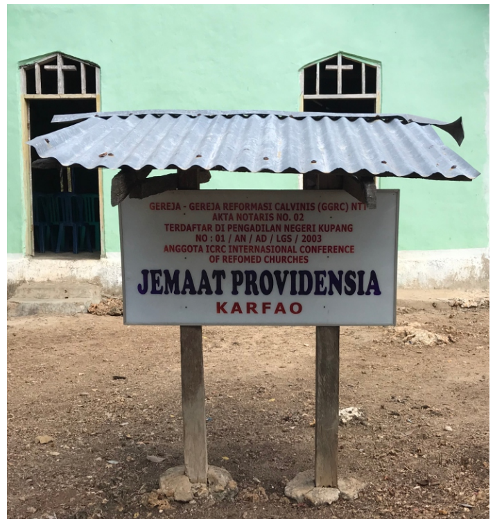
A Reformed Church on Roti Island, Indonesia