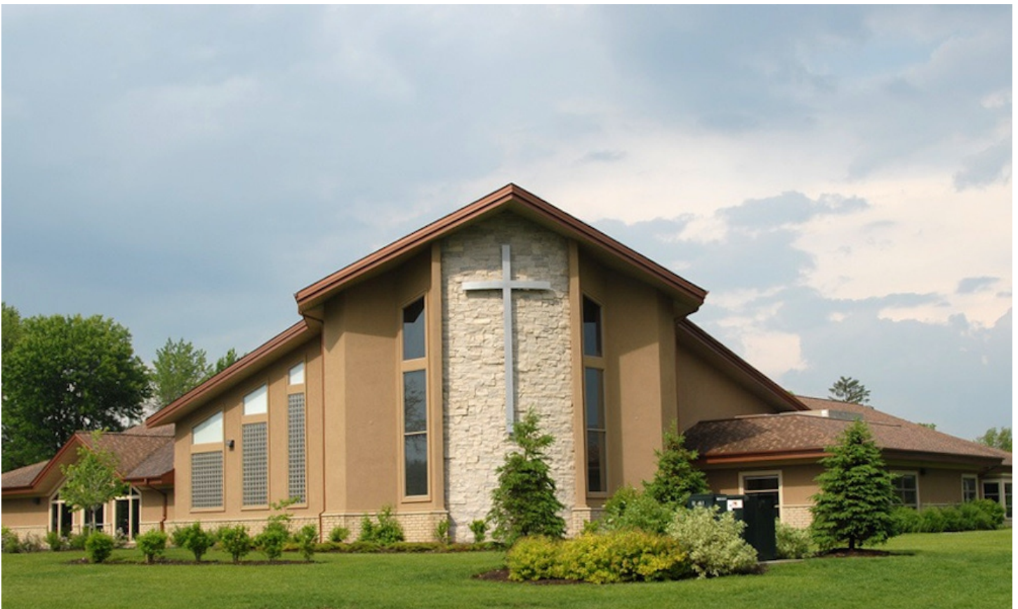
Toronto-Bethel Canadian Reformed Church

Republished with permission from Clarion, a magazine serving the Canadian Reformed Churches.